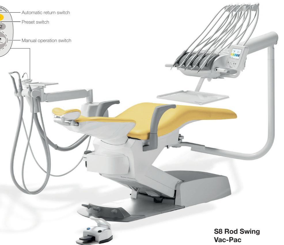
S8 Rod Swing Vac-Pac