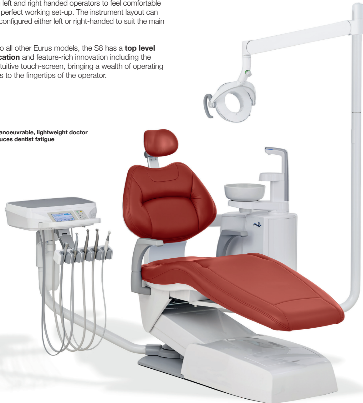
Eurus S8 holder type

Highly manoeuvrable, lightweight doctor table reduces dentist fatigue