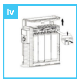
Pull up to take off cover