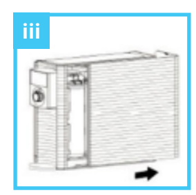
Open the door