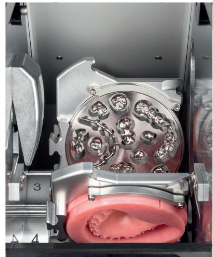
8-fold disc changer