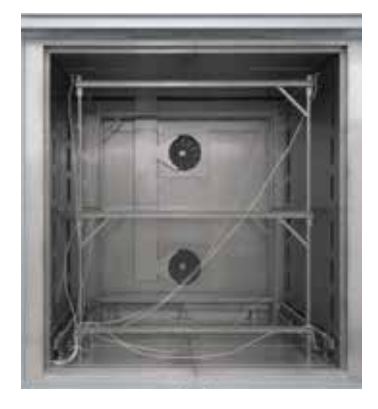
Pluggable frame for measurement for forced convection chamber furnace N 7920/45 HAS