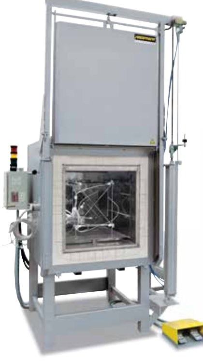
Holding frame for measurement of temperature uniformity

In standard furnaces a temperature uniformity is guaranteed as +/- K without measurement of temperature uniformity. However, as additional feature, a temperature uniformity measurement at a reference temperature in the work space compliant with DIN 17052-1 can be ordered. Depending on the furnace model, a holding frame which is equivalent in size to the work space is inserted into the furnace. This frame holds thermocouples at 11 defined measurement positions. The measurement of the temperature uniformity is performed at a reference temperature specified by the customer at a pre-defined dwell time. If necessary, different reference temperatures or a defined reference working temperature range can also be calibrated.