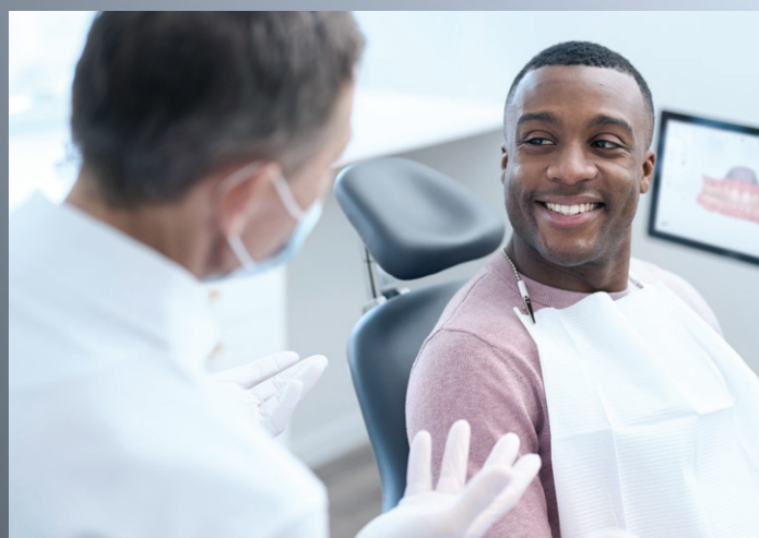
Patient engagement you can sense.

Boost case acceptance by engaging – even more – with your patients. Together, TRIOS 3D color scans and the TRIOS engagement apps create a perfect opportunity to show patients their unique dentition and help them understand their treatment needs. They'll notice the difference. And, you'll feel the engagement.